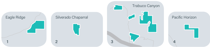
ENVIRONMENTAL MITIGATION PROGRAM PRESERVES