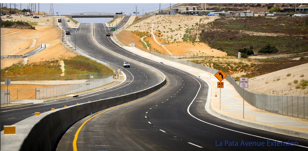
La Pata Avenue Extension